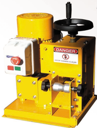
CSX 2000 Single Phase or 3 Phase