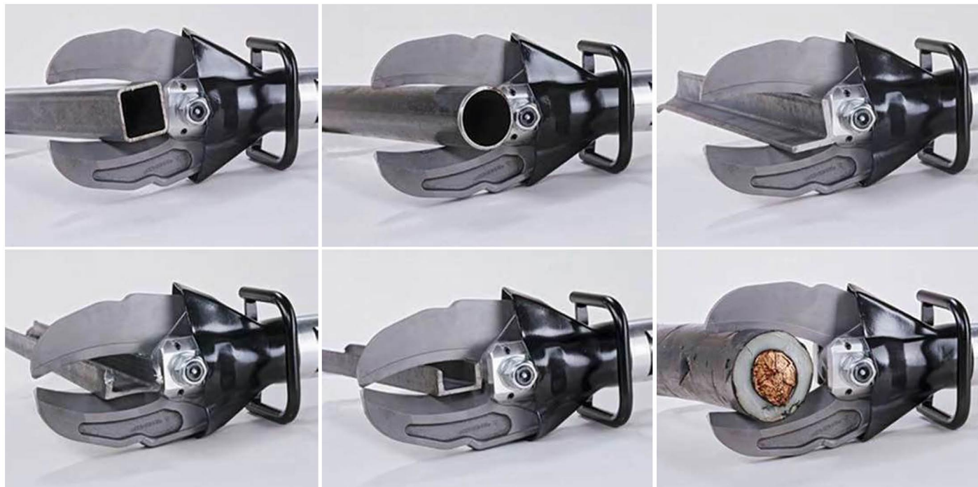
VARIOUS BLADE STYLES AVAILABLE ON ALL TOOLS